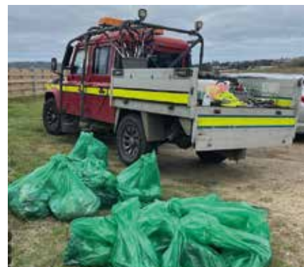
Litter collected from one beach clean!

Will be listed on the Bembridge PC website and on the Facebook page with the first one in 2025 – Saturday 18 January and following on Saturday 22 February and monthly thereafter.