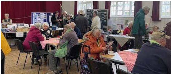
Community Action Day, Bembridge Village Hall