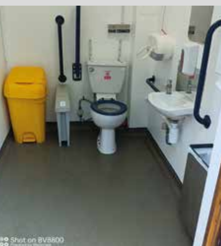
L – R Top: St Luke's Cemetery and Improving the drainage at Lane End Cemetery Bottom: Refurbished Village Hall toilet, Hedge/tree cutting at Lane End Cemetery and keeping Bembridge signs clean