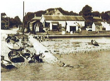
1940s photograph of Lane End beach